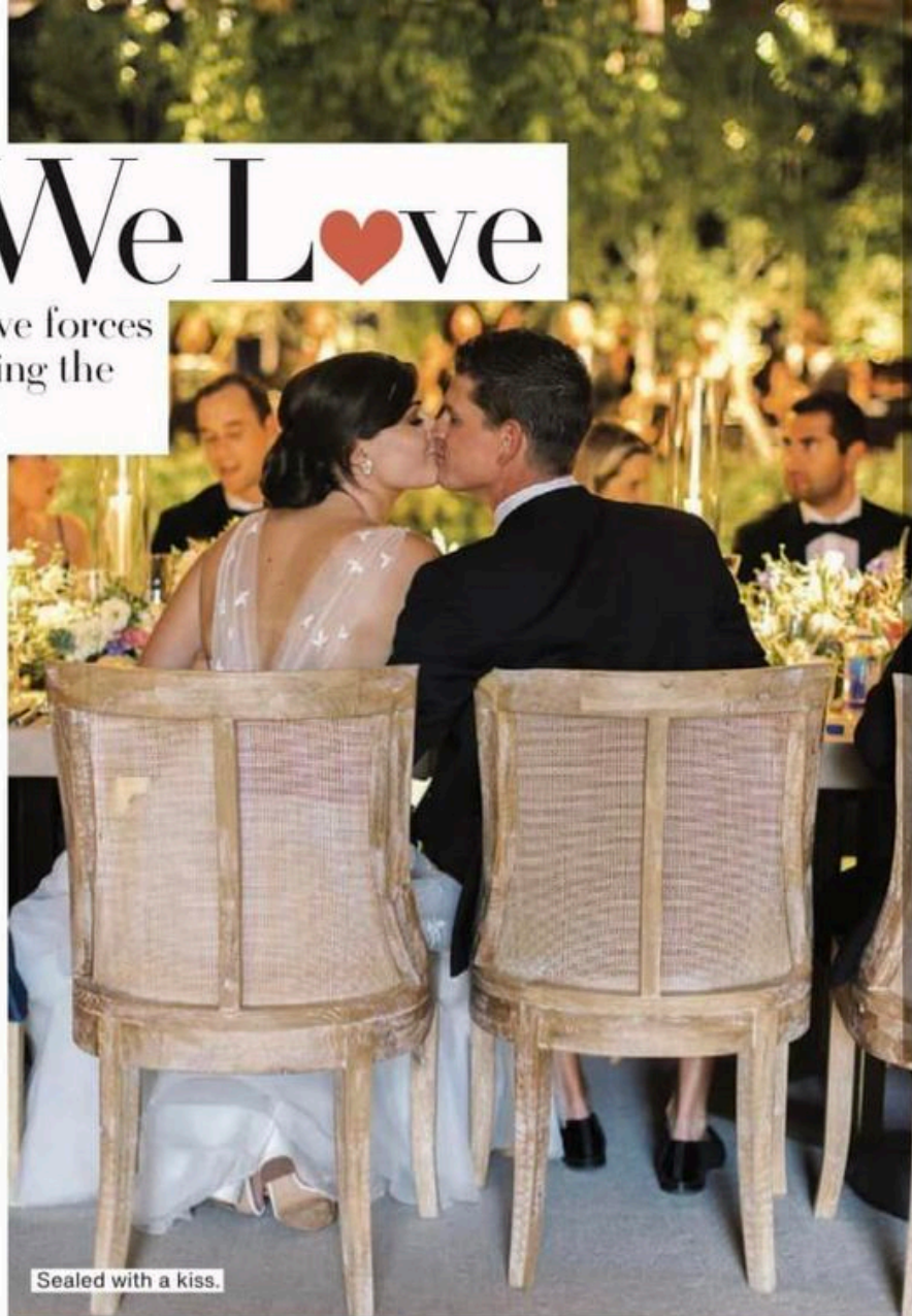
Sealed with a kiss.