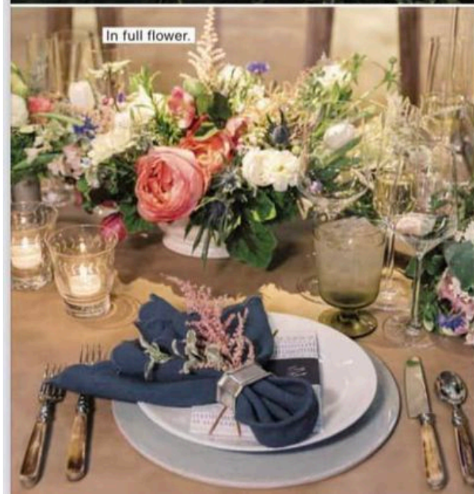
In full flower.