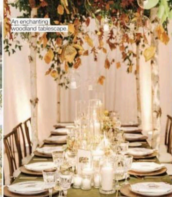
An enchanting woodland tablescape.