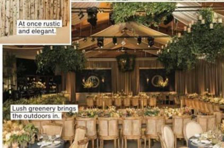
Lush greenery brings the outdoors in.