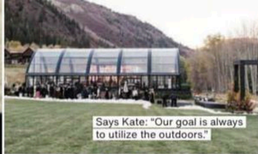
Says Kate: "Our goal is always to utilize the outdoors."