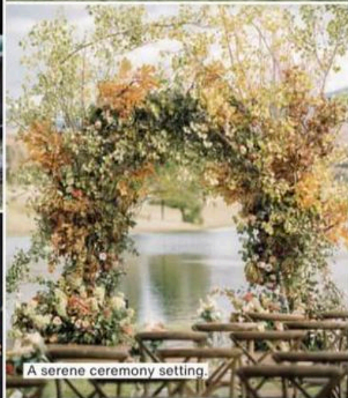
A serene ceremony setting.