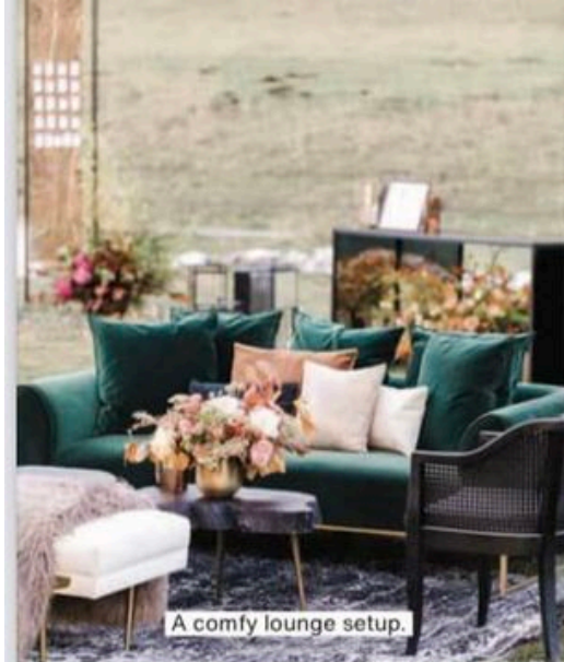
A comfy lounge setup.