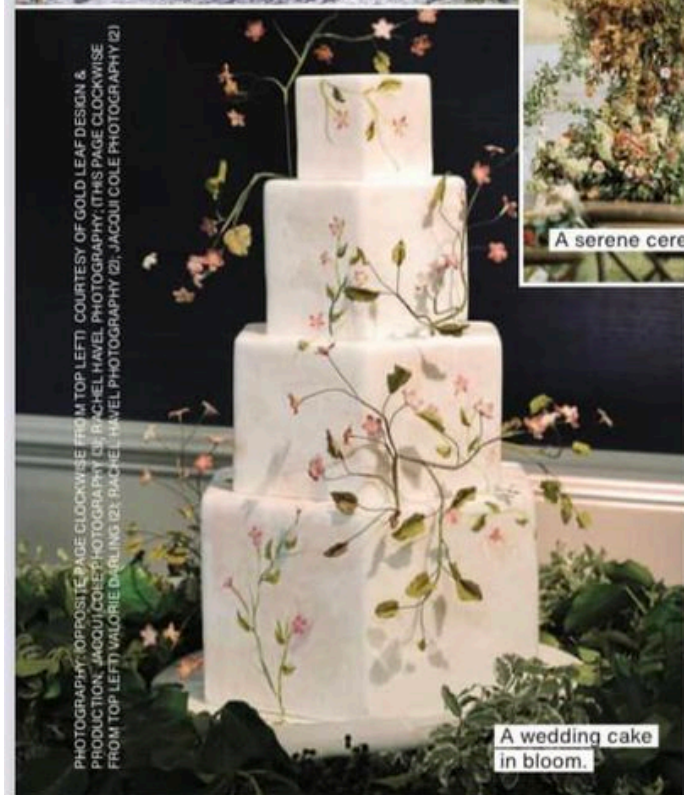
A wedding cake in bloom.